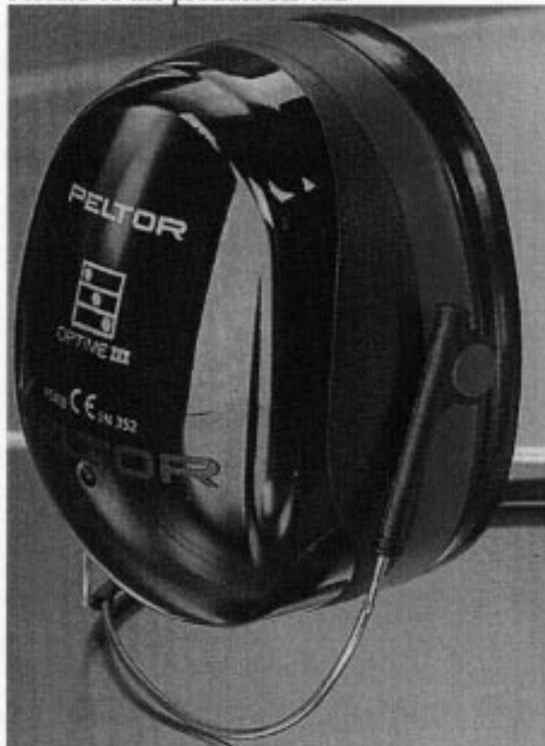
Picture of the product H540B