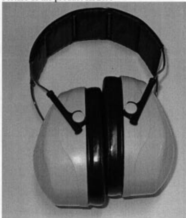
Picture of the product H520A